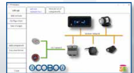
WORKSPACE MANAGER Organize and switch different environment