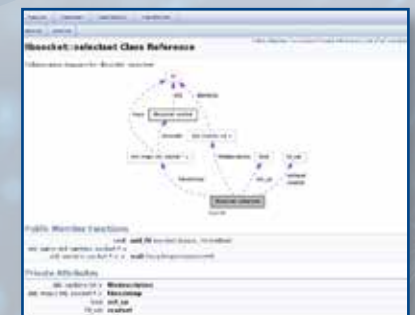
AUTO DOCUMENTATION Standardize document with re-usable templates