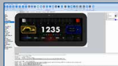
VT3 STANDARD Continue to develop as today