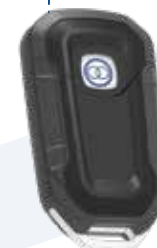
INTELLIGENT KEYFOB Low consumption