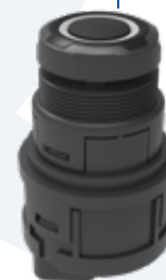
ACTIVE ECU Mainly customizable