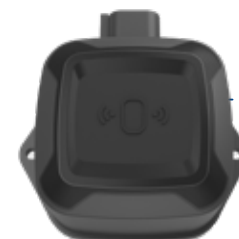
RANGE EXTENDER Active antenna