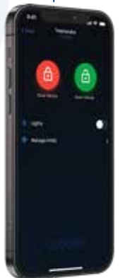
SMARTPHONE Key assistant