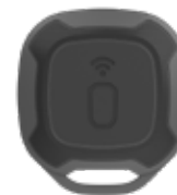
PASSIVE KEY DUPLICATOR Small and portable